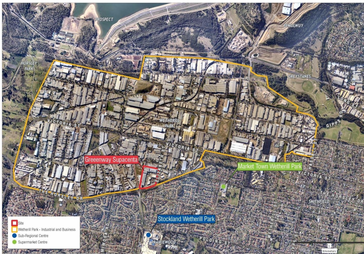
Figure 1 – Site Location

Land to the north, east and west of the site consists predominantly of low density bulky goods retail outlets on large lots. Land to the south comprises residential land uses, predominantly low density dwelling houses separated from the site by The Horsley Drive.