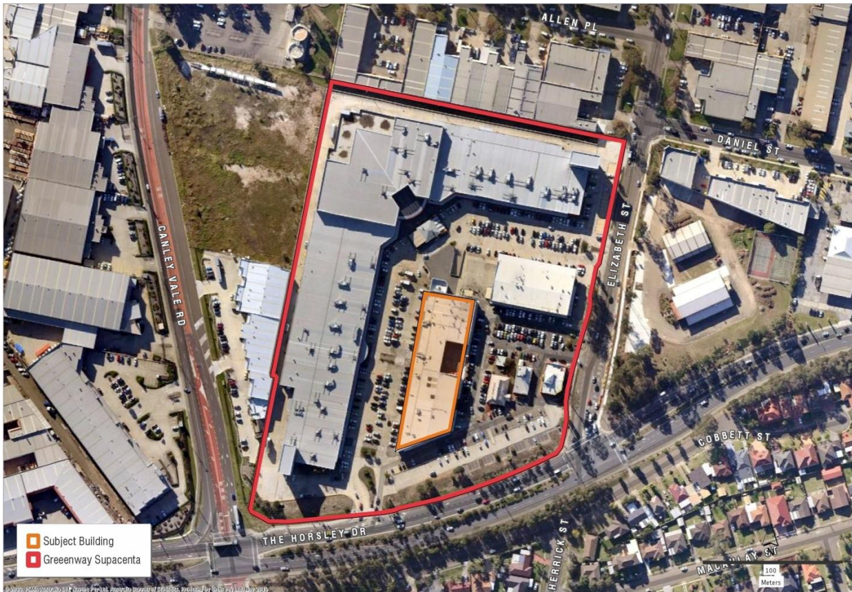
Figure 2 – Site Plan

The proposal relates to the existing retail, business and offices tenancies situated at ground floor and mezzanine level of the southern wing of Greenway Plaza (Units 1-7 ground floor and Units 1-6 mezzanine level) as illustrated in Figure 2 below.